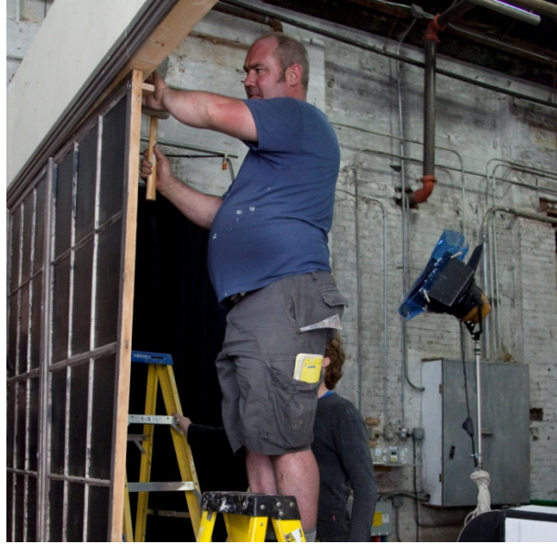
Kent Lanigan supervised the construction of most of the sets, as well as the most ambitious prop, a replica of Berkeley's 27-inch cyclotron.